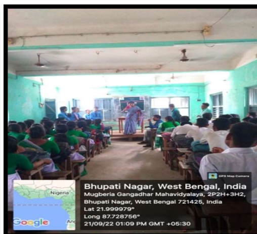
Figure: Awareness activities at Krishnanagar Manindranath High School regarding Rashtiya Poshan Maah.